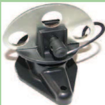
Gate handle insulator – triple

Item no. 0597-001 black, at 10 pieces / bag