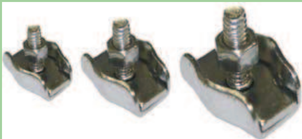
Rope and cord connector "Simplex", galvanised