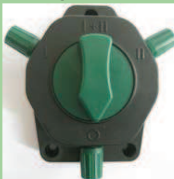
Earthing switch / fence switch